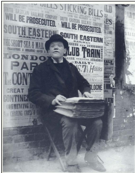
A photograph from the Samuel Butler Collection

Look at this picture carefully. What story does it tell? Your challenge is to translate the photo-story into words. Use the questions below to get started... and don't forget to use your imagination!