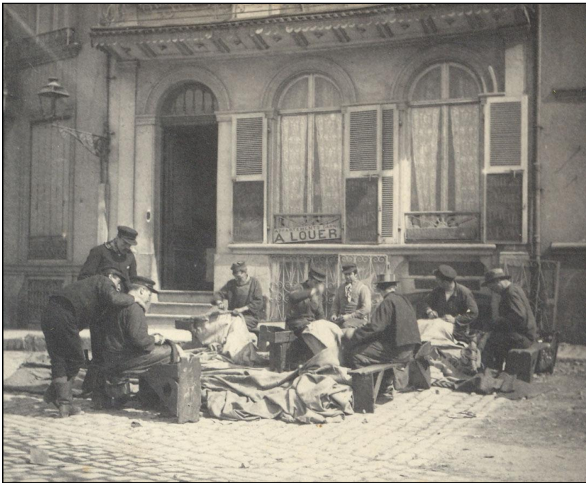
A photograph from the Samuel Butler Collection

Look at this picture carefully. What story does it tell? Your challenge is to translate the photo-story into words. Use the questions below to get started... and don't forget to use your imagination!