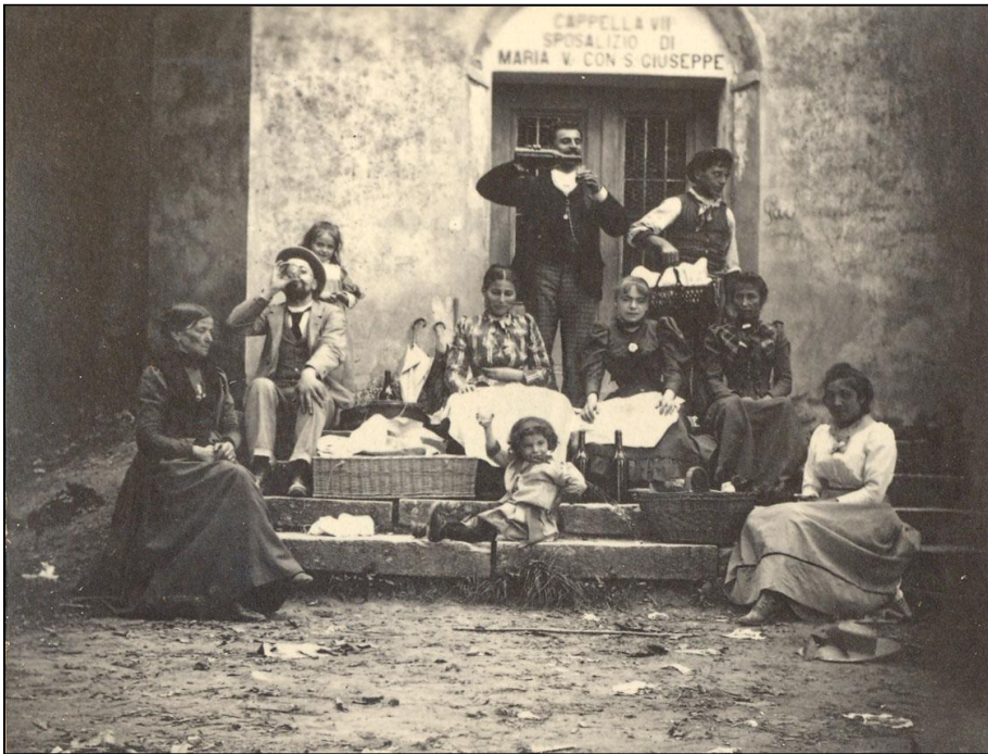
A photograph from the Samuel Butler Collection

Look at this picture carefully. What story does it tell? Your challenge is to translate the photo-story into words. Use the questions below to get started... and don't forget to use your imagination!