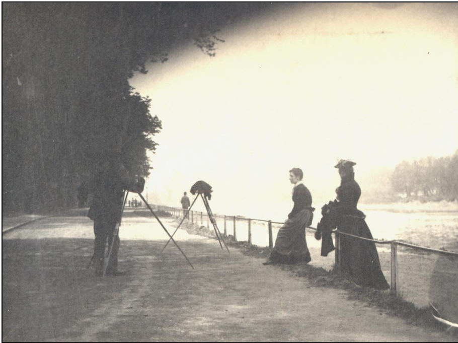
A photograph from the Samuel Butler Collection

Look at this picture carefully. What story does it tell? Your challenge is to translate the photo-story into words. Use the questions below to get started... and don't forget to use your imagination!