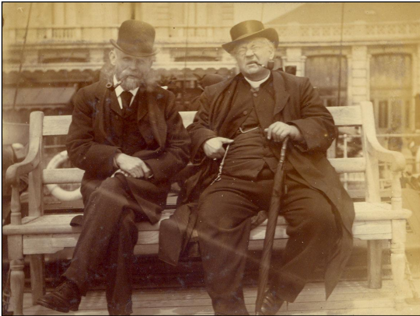
A photograph from the Samuel Butler Collection

Look at this picture carefully. What story does it tell? Your challenge is to translate the photo-story into words. Use the questions below to get started... and don't forget to use your imagination!