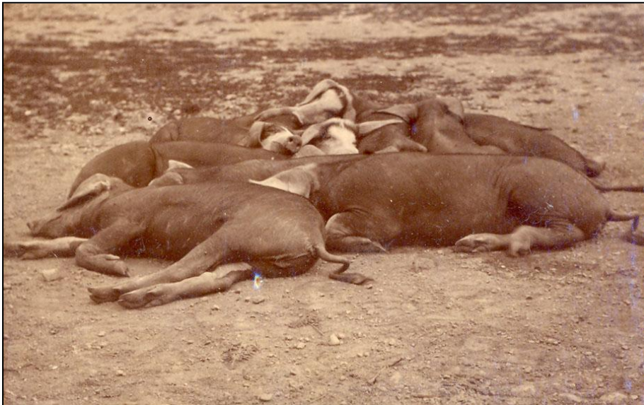
A photograph from the Samuel Butler Collection

Look at this picture carefully. What story does it tell? Your challenge is to translate the photo-story into words. Use the questions below to get started... and don't forget to use your imagination!