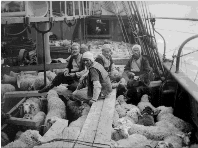
A photograph from the Samuel Butler Collection

Look at this picture carefully. What story does it tell? Your challenge is to translate the photo-story into words. Use the questions below to get started... and don't forget to use your imagination!