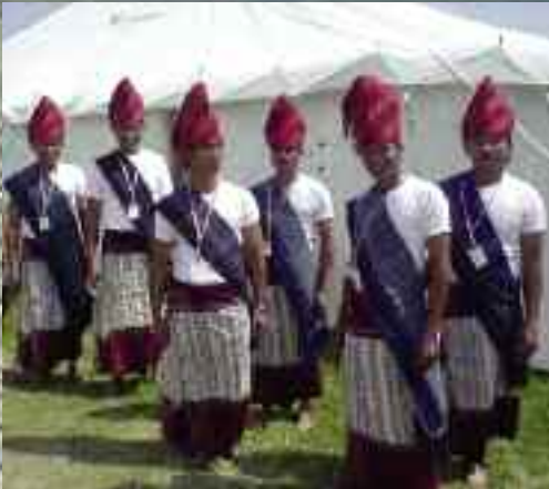
Marsada, WOMAD 2004