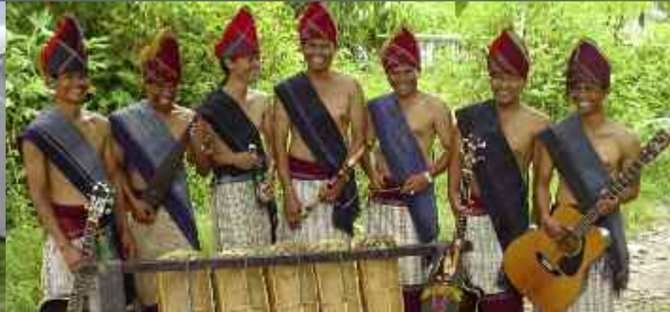
Marsada with instruments (Indonesia)