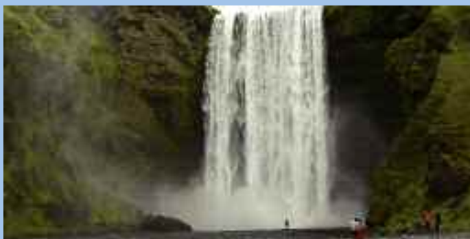
Skogafoss Waterfall, Iceland

Each year the College makes a number of Travel Awards to junior members. These grants allow students to pursue research, conduct charitable work and expand their knowledge of the world. In 2007, St John's students travelled to locations as diverse as Honduras, Inner Mongolia, Malawi and Argentina, to name but a few.