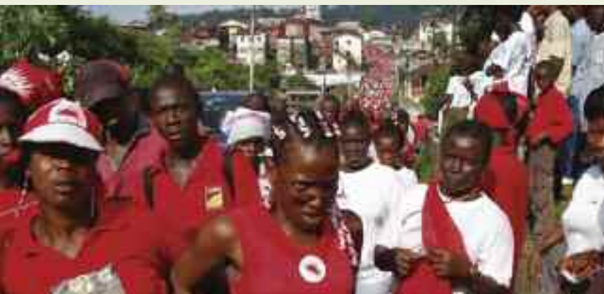
APC Supporters Preparing for Victory, Freetown, July 2007

Sierra Leone leaves quite an impression on new arrivals: the helicopters that ferry people from the airport at Lungi across the river estuary to the capital provide a stunning view of the extraordinary geography of Freetown, with thickly forested hills rearing high out of the blue of the Atlantic Ocean.