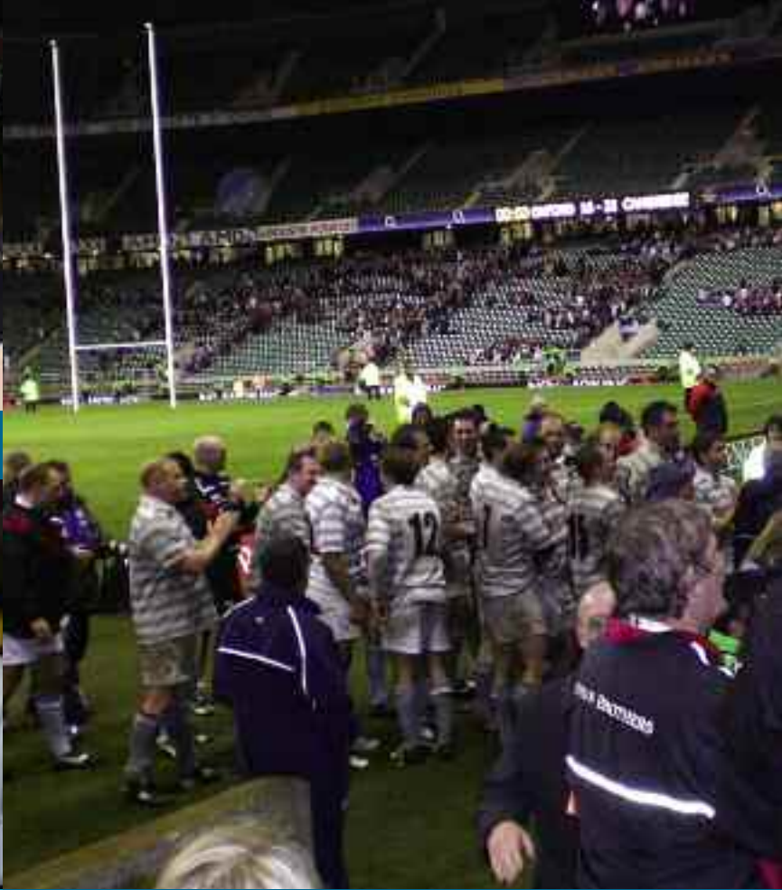
The Cambridge team celebrates after the match