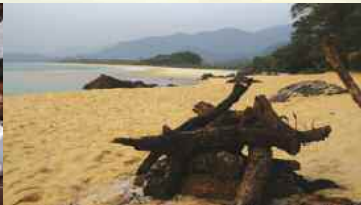
Bureh Town Beach, Freetown Rural District

During the rains, just abating when I arrived in late September 2005, the tropics open up with an assault of lightning and torrential downpours that gave the country its name, coined by Portuguese naval explorers in the fifteenth century after the thunder that sounds like the fabric of the sky is being ripped apart.