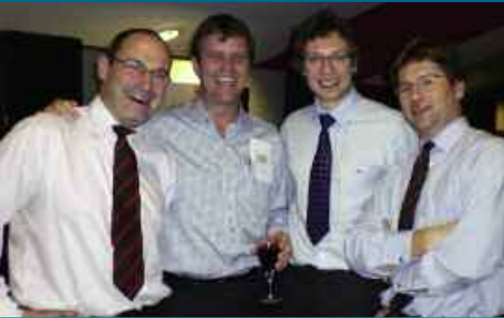
Spirits were high after the match