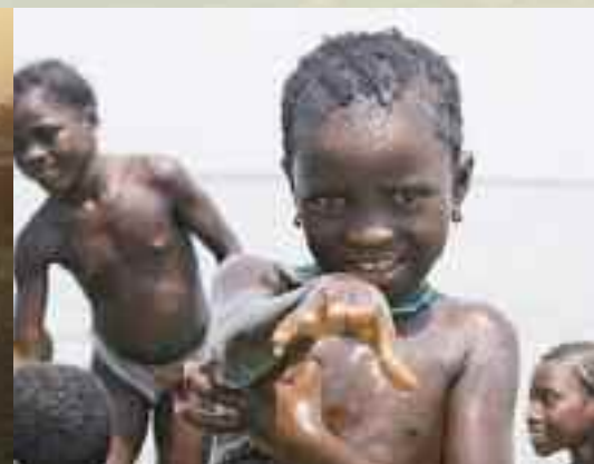
Turtle Island Children, Bonthe District

societies into those that provide what we in the West take for granted. Hopefully, I also managed to make myself useful in a country that has fewer competent economists than one year's undergraduate intake in a handful of Cambridge colleges, and yet a staggering potential demand for planning, monitoring and evaluation of budgets, projects and policies.