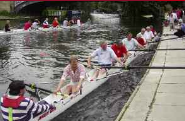
Fellows take to the river, LMBC Regatta, September 2007