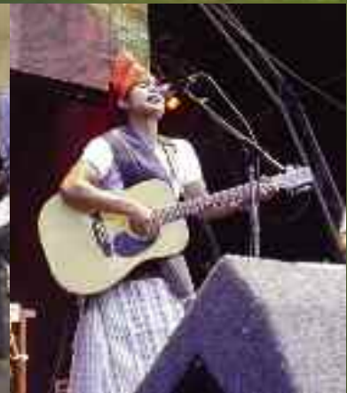
Marsada, Edinburgh Fringe Festival 2004