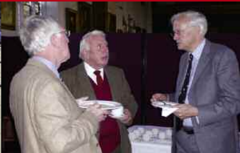
Johnians enjoyed talking to the Master (right), Johnian Society Day, December 2007