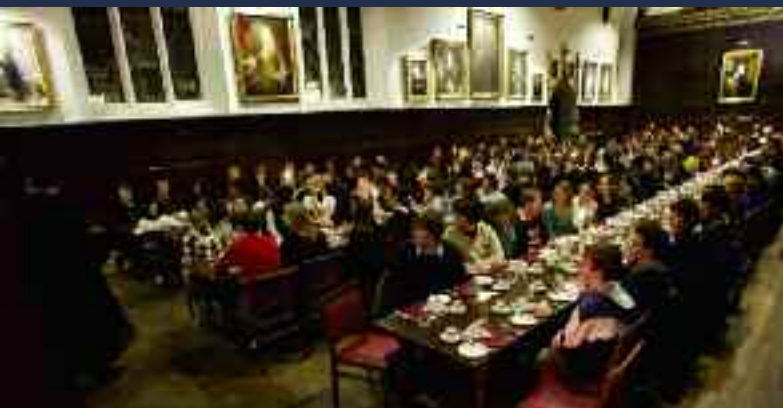
CUSU Shadowing Dinner, February 2008