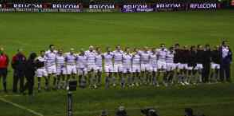
Cambridge line up before the Varsity match, December 2007