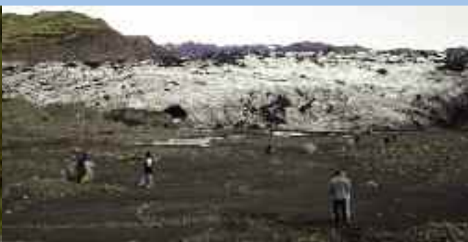
Solheimajokull glacier, Iceland