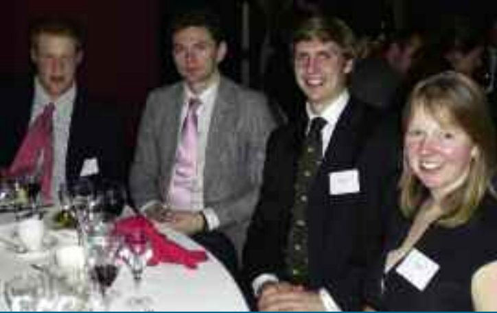
Recent graduates mingled before the match