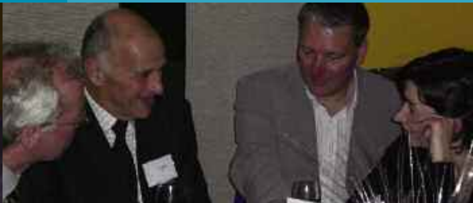
Johnians share a joke in Edinburgh, December 2007