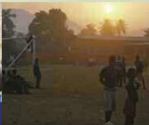
Football Match at Sunset in Makeni, Bombali District