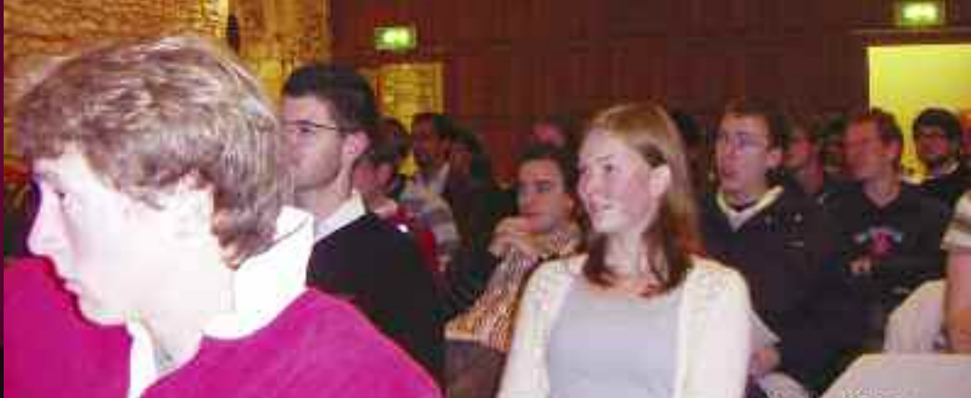
Students listening attentively to the talks