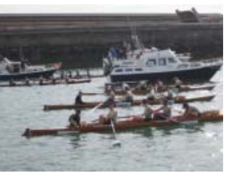
The start of the race

said, 'We thought it would take over four hours to complete the race but with wind speeds of 6.6 knots we had optimal conditions and we are now awaiting confirmation from the Guinness Book of Records as to whether we have set a new record.