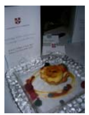
The University's 800th Campaign Launch dinner