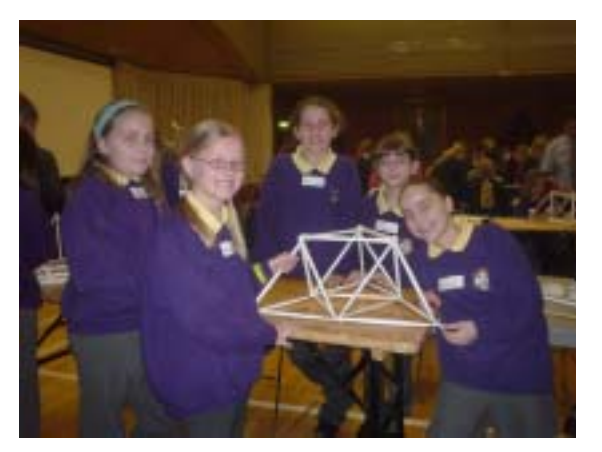
Building a rocket launcher in the Fisher Building

These courses provided an opportunity for children to be creative in seeking solutions to real engineering problems. One parent commented that her son had arrived home 'exhausted and exhilarated', which is probably our best measure of success. \circledast