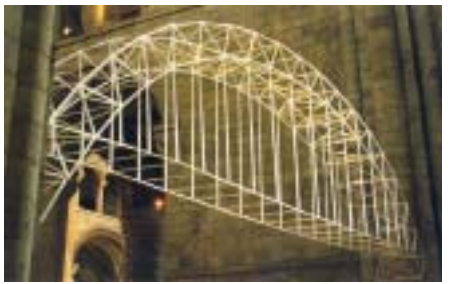
A model of the Tyne Bridge made by 850 children

The Project has two strands: Teacher Associates working on projects to improve the teaching of their subjects; and support for initiatives which attract young people to careers in mathematics, science and technology. Those who wish to become Teacher Associates must present details of their proposed project and can apply for funding to provide up to 40 days of teaching 'cover' at their school. The distribution of the 40 days can be chosen to meet the requirements of the project, the teacher and the school.