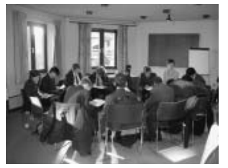
Eagle Project students on a visit to St John's College

I applied to Karlsruhe University in Germany, where there seemed to be no restriction on the number of undergraduates they took and no selection procedure. There were about a thousand students squeezed into a lecture theatre with only six-hundred seats. There was no support for students and this lead to a 50% drop out rate. In contrast, the St John's admissions system gives feedback to students; we don't want to admit people who are not suitable and then see them drop out. The people who do come to St John's are given a great deal of support to ensure that they get the most out of their time here. 🛞