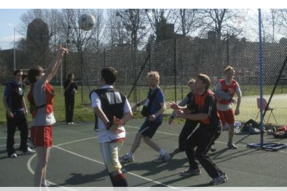
The mixed Netball Team in action

Both teams displayed determination, despite severely depleted squads, at the 2009 Cuppers Tournament. The Mixed Team secured a place in the quarter finals, but Emmanuel defeated them in extra time by one goal. The Ladies' Team fell just short of a quarter-final place, sidelined by an incredible performance by the eventual winners, Trinity, and a one goal deficit against an impressive Trinity Hall. It was a day of spectacular performance and camaraderie.