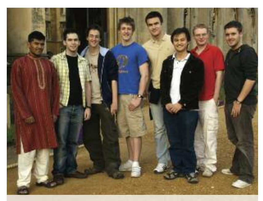
The Chess Club

The Cuppers matches are hard work and can last up to three hours. Our first match was against the Division I Jesus team. We knew it would be tough and each match was very well fought. In the end we drew on board count but lost on board elimination – the method of determining the winners of a drawn match. It was an extremely encouraging match and we were unlucky to lose. We also lost in the Plate to Queens', who will be in Division I next year.