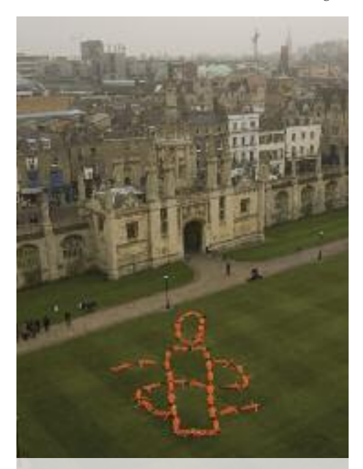
Members of Cambridge University Amnesty International

Writing letters remains one of the most effective ways to create change, as the huge successes of Amnesty International have shown. However, we are also involved in fundraising and creating awareness. Cambridge University Amnesty International, which we support and work with, won the 2008 Amnesty International UK Student Raise-Off for having collected more donations for AIUK