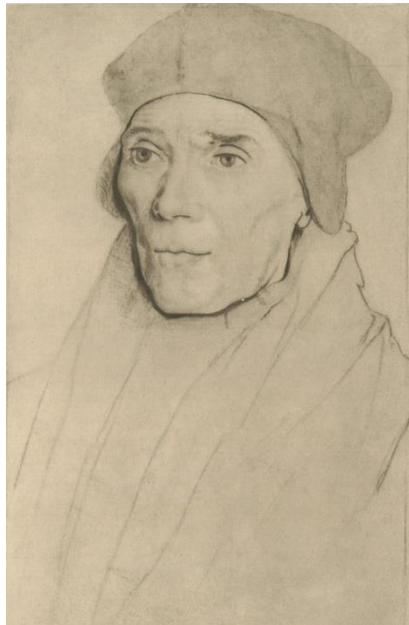
John Fisher (1469–1535) from the Holbein portrait-drawing in the Royal Library, Windsor